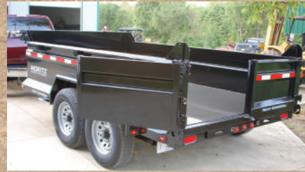
Gate Hold Backs