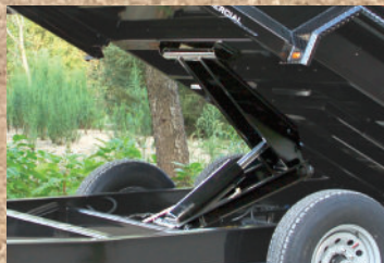
Scissors Hoist Standard on 12' & 14' (cylinder on 10')