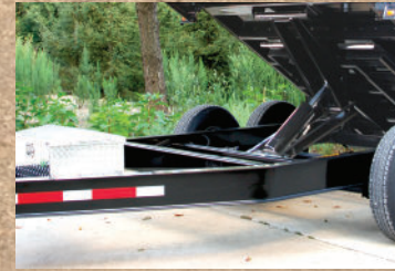
8" I Beam Frame