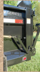
Trip Lever Option