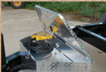
Aluminum Tool Box with Storage Area (steel box on gooseneck)