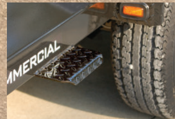
Step for Bed Access