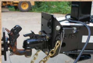
Heavy Duty Adjustable Coupler (4 bolt)