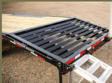
Optional Traction Angles Across Tail