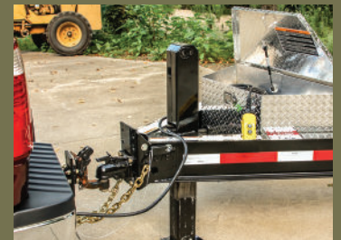
Optional Hydraulic Jack