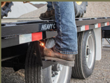
Step to Access Deck