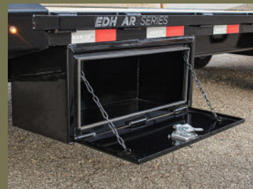
Optional Under Body Tool Box