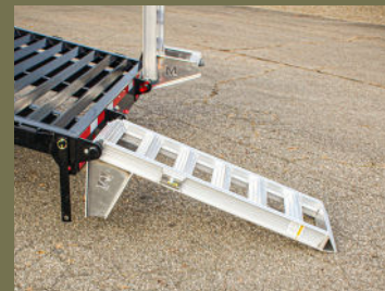
Heavy Duty 4" Channel Aluminum Ramps These Ramps Tested Stronger Than our 3" Steel Channel Ramps on our Previous Model