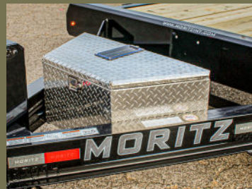
Aluminum Tool Box