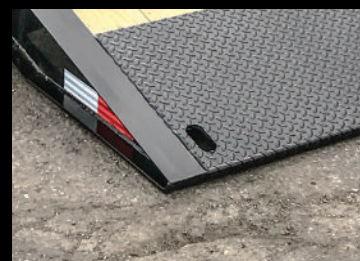
Tie Down Slot in Tail