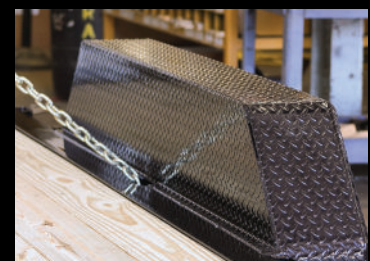
Tie Down Between Fenders (flush w/deck & fenders)