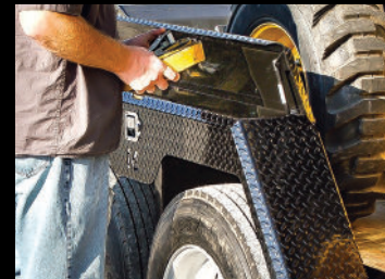
Optional Fender Tool Boxes (ratchet boomer storage)