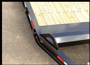
Cold Formed 8" I Beam