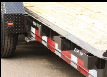
Heavy Duty 4" x 1/4" Bar Stake Pockets