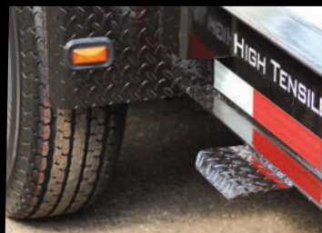
Step To Access Deck