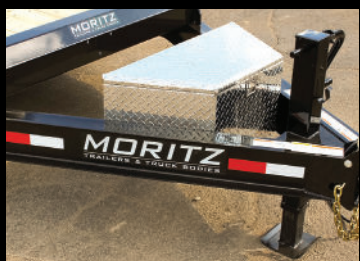
Aluminum Tool Box