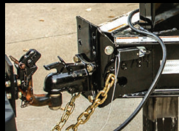
Heavy Duty 4 Bolt Adjustable Coupler