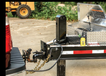
Optional Hydraulic Jack