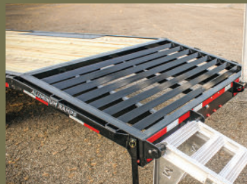
Optional Traction Angles Across Tail