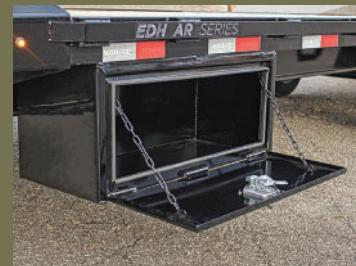
Optional Under Body Tool Box