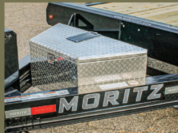
Aluminum Tool Box