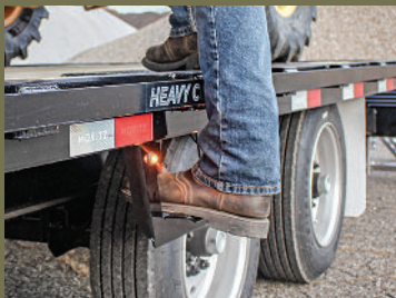
Step to Access Deck