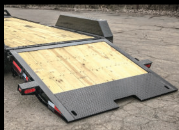
Hydraulic Tail with Autolock System