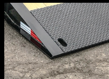
Tie Down Slot in Tail