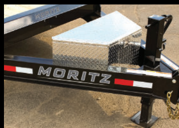
Aluminum Tool Box