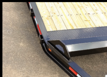
Cold Formed 8" I Beam